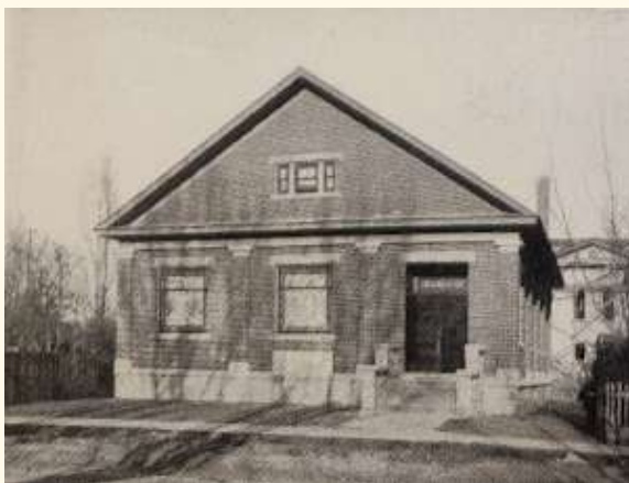
Original Boise Church edifice completed in 1904, dedicated October 1907

First Church of Christ, Scientist, Boise, established in 1899, is a branch of The Mother Church, The First Church of Christ, Scientist, in Boston, Mass.