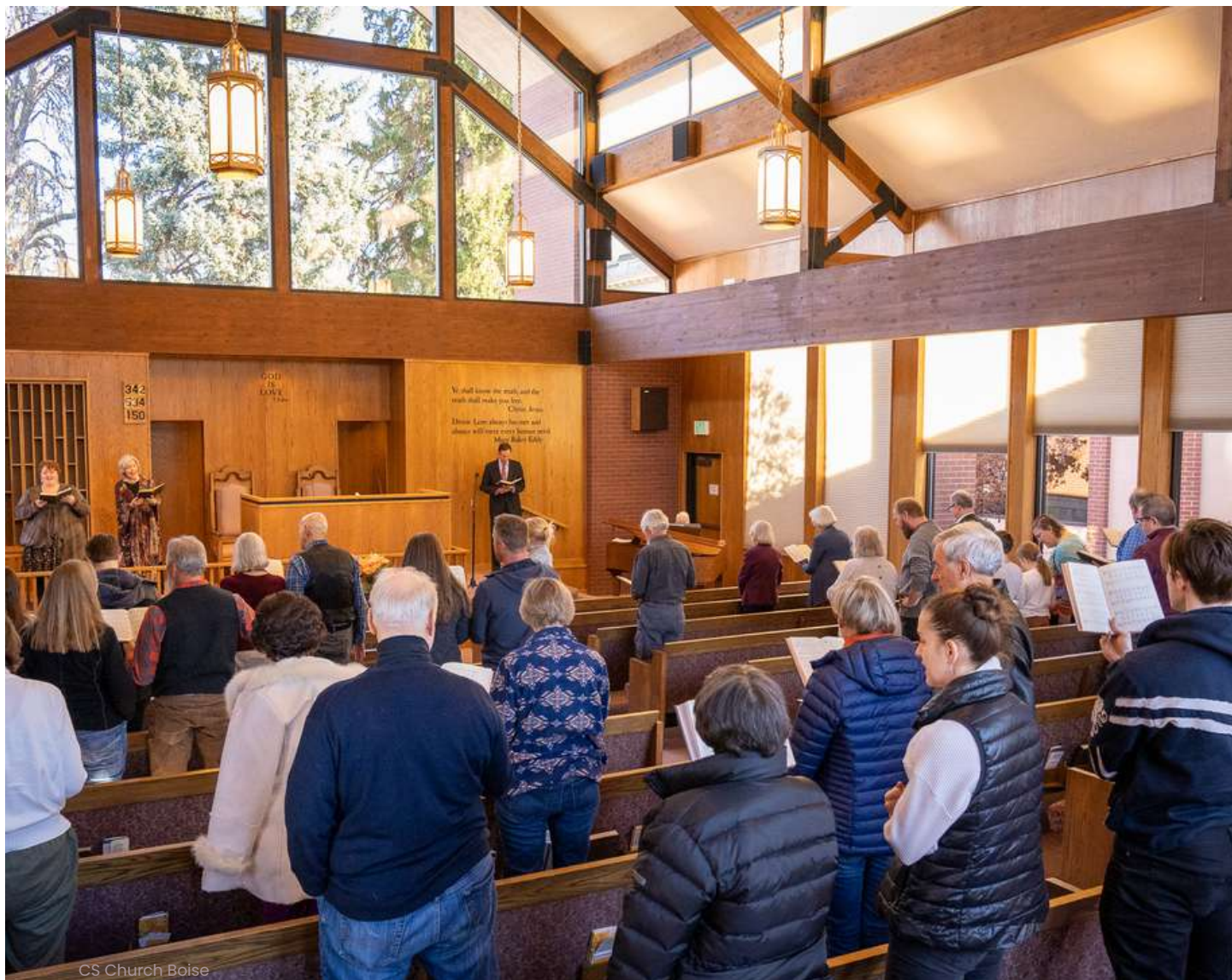
CS Church Boise