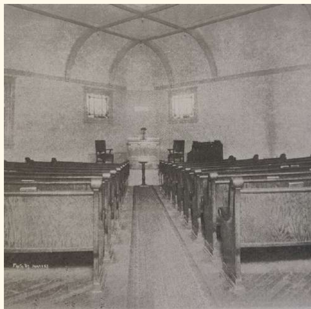
Interior of First Church of Christ, Scientist, Boise Approximately 1907